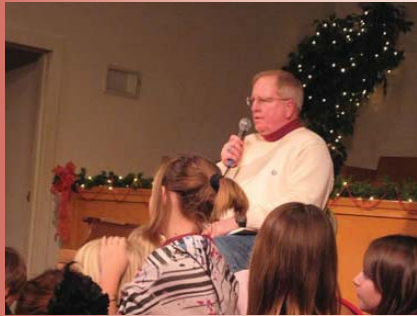
Uncle Hank shared a story to close out the program.