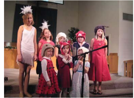
The Praise Kids sang "The Friendly Beasts."