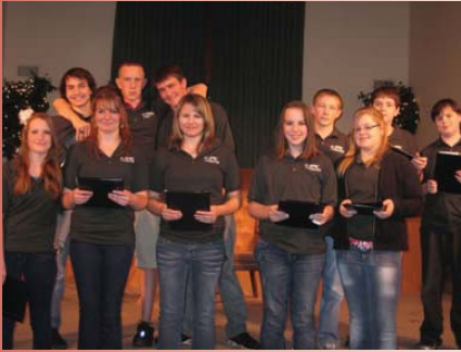
The GPBC Friends Choir sang "Do You Hear What I Hear?"