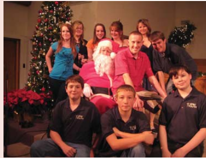
Santa came and shared goodies with good girls and boys including the GPBC Friends Choir.