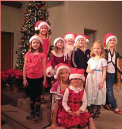
Santa loves the Praise Kids!